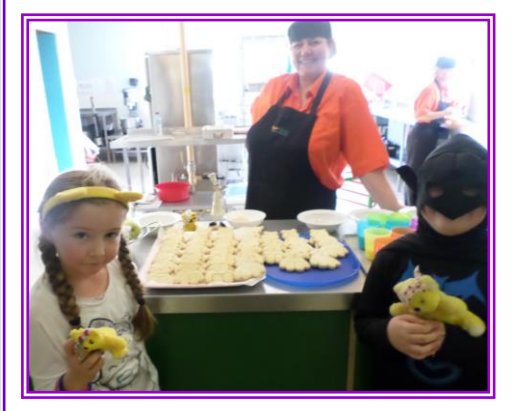
Pudsey Bear Biscuits for Children in Need

Good job there wasn't a health and safety inspection!