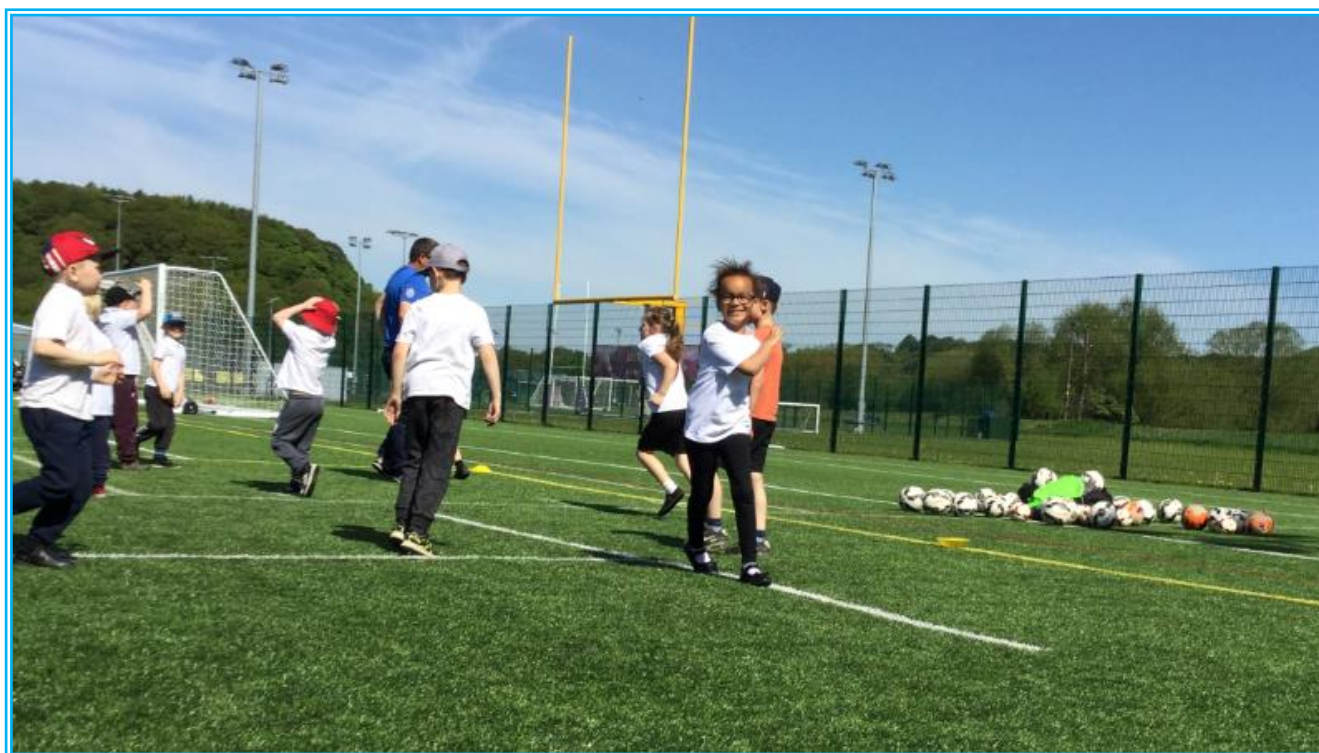
They also enjoyed learning dodgeball and football skills at Maiden Castle.