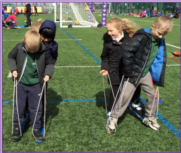
Class 2 learned survival skills and took part in an outdoor treasure hunt.