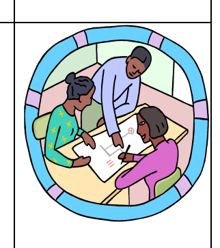
•10 WEEKS (3 months) before first Review conference. Evaluate effectiveness of Core Group in effecting change and better care of the children ● `..to review the safety, health and development of the child against the planned outcomes set out in the child protection plan' ●to see whether CP plan should continue to be in place or should be changed ●Child's wishes and feelings must be sought and taken into account ●if the child is not still at risk of significant harm then they should not require a CP plan ●Tasks: report needed and shared with parents/carers 7 days prior to conference: evaluation what has changed, the impact on child's welfare against objectives set out in the plan

•10 DAYS later. Date for this meeting and first Review Conference is set at the Initial Conference •This 'core' of essential professionals will work with the family and the young person to try and achieve change and improvement so that the child is not still at continuing risk of harm (these safety issues are dealt with before other 'welfare' matters) • Key worker is the social worker •The group complete the Child Protection Plan and complete work on the core assessment as part of this •The chronologies are merged and continuously updated as working documents •Initially meetings quite frequent but generally held about every 4-6 weeks